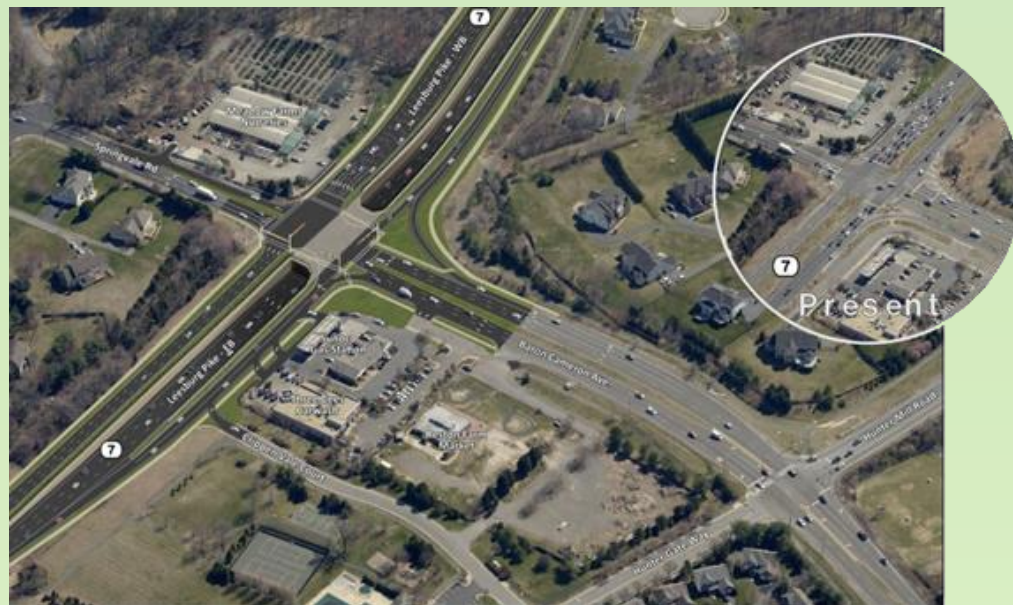
Planned partial interchange at Route 7 and Baron Cameron Avenue

For more information and updates, visit www.connectroute7.org